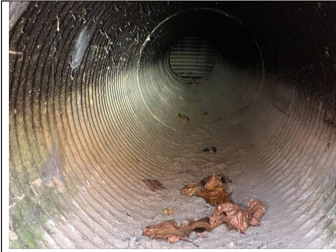
Photograph 7: Pond Complex Outlet Pipe in generally good condition with no signs of blockage.