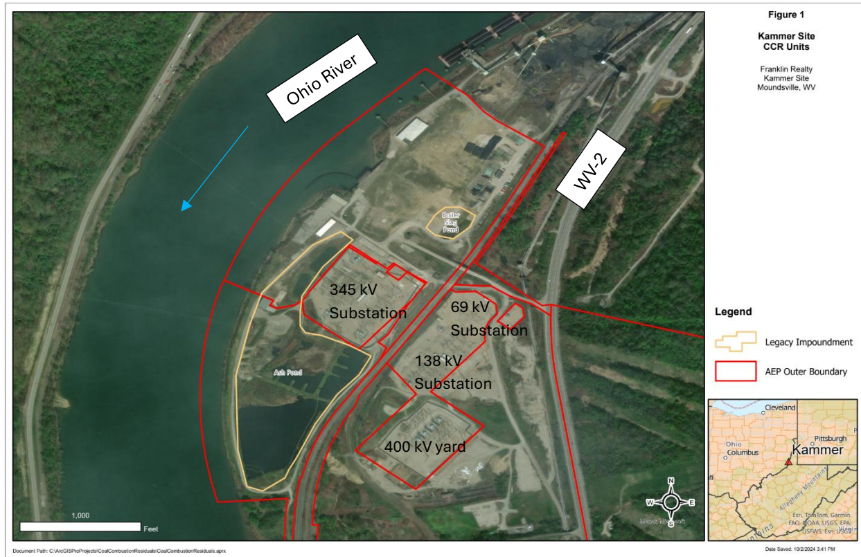
Figure 1: Site Vicinity Map

The Kammer Power Plant was placed in service in 1958 and subsequently retired in May of 2015.