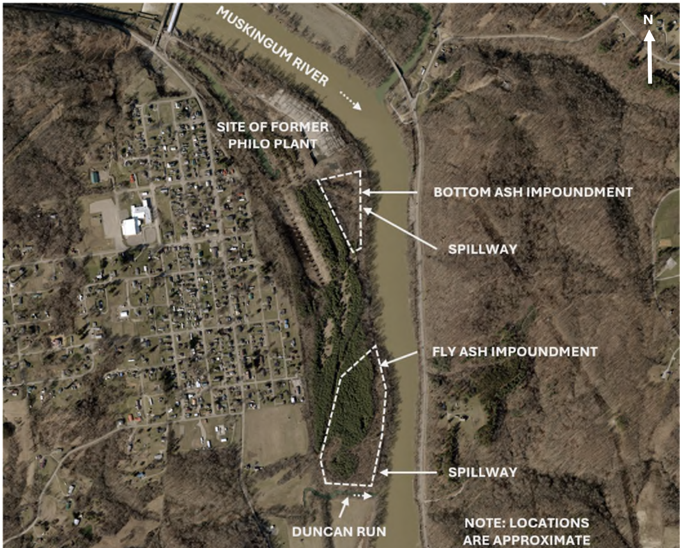
Figure 1-1 – Former Philo Plant Site (2020 OGRIP Image)